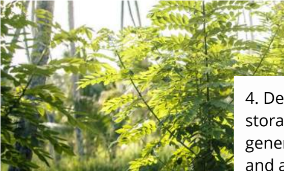
4. Deploying carbon capture and storage from Evergreen Energy generation in biomass power plants and achieving negative emissions of 2.5 billion tons CO2 per year.